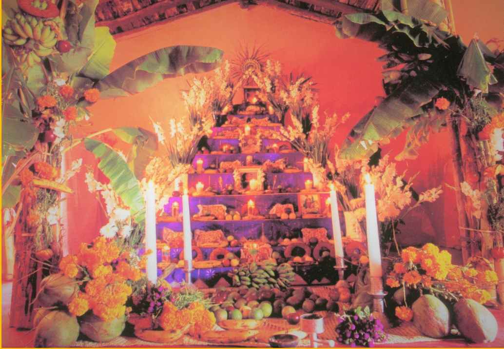
Día de los Muertos Altar, Oaxaca.

Celebrate in honor and remembrance of departed loved ones and ancestors.